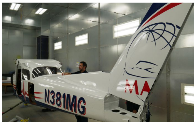
Here is the 172 in our paint booth, after shooting the final coat of red paint and removing most of the masks.