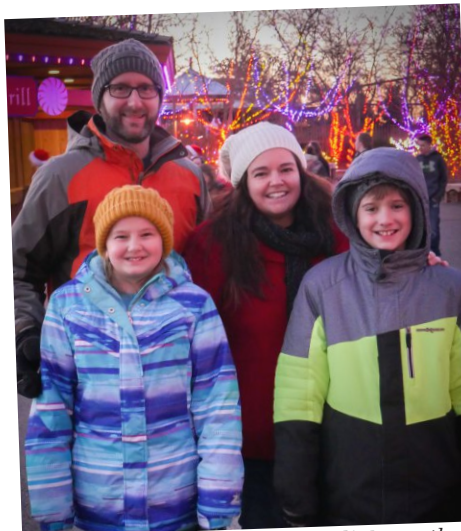
Some friends invited us to the lights at the Columbus Zoo before we went back to Northwest Ohio for the holidays.